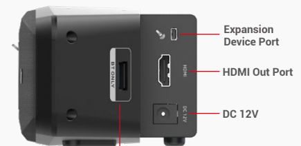
Bluetooth® Dongle Port