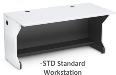
-STD Standard Workstation