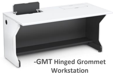
-GMT Hinged Grommet Workstation