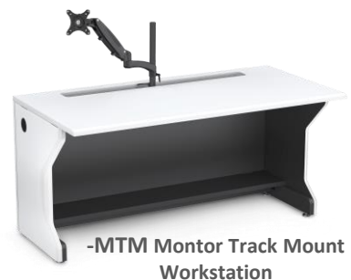
-MTM Monitor Track Mount Workstation